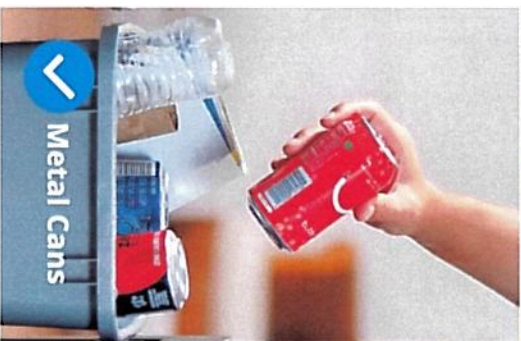
✓ Metal Cans