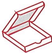
Dirty paper & cardboard