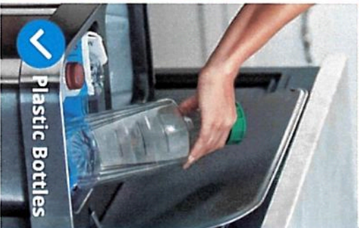
✓ Plastic Bottles