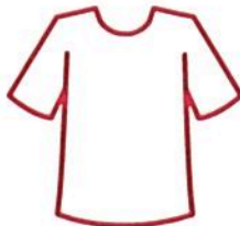
Clothes & shoes