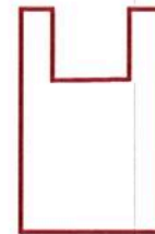
Plastic grocery & sandwich bags